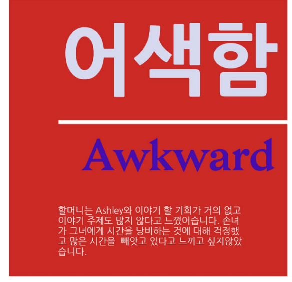
Fig. 3 Representative flashcards for "awkward feelings". Flashcards based on the CHATogether skit " Grandparent–grandchild language barriers and overcoming them ." To help bilingual parents and grandparents understand various emotional expressions, flashcards are translated into multiple Asian languages, including Chinese and Korean (upper and lower panels on the right, respectively). Artwork and translation by Joan Yang and Violet Tan