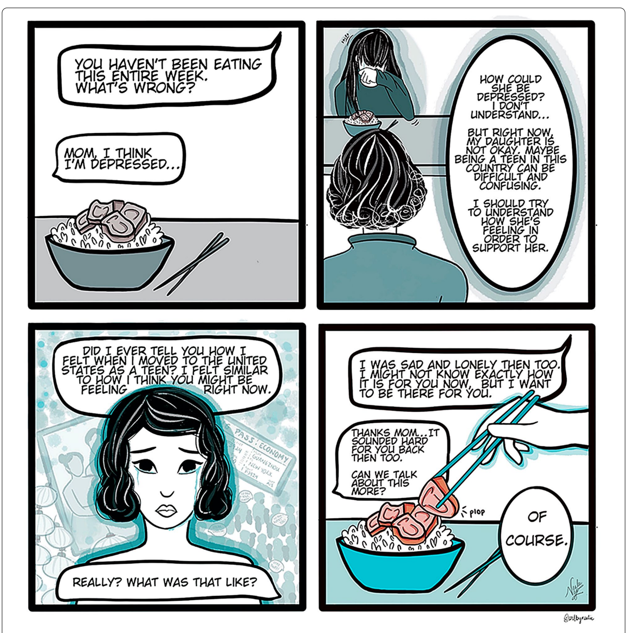
Fig. 2 Example of mentalization in an AAPI context during a mother–daughter interaction. Illustrative panel from the graphic novel, "Mentalization: A Comic About Asian American Mental Health". Artwork by Nealie T. Ngo, MPH

tural adaptation, relatability, and extraction of potential teaching points.