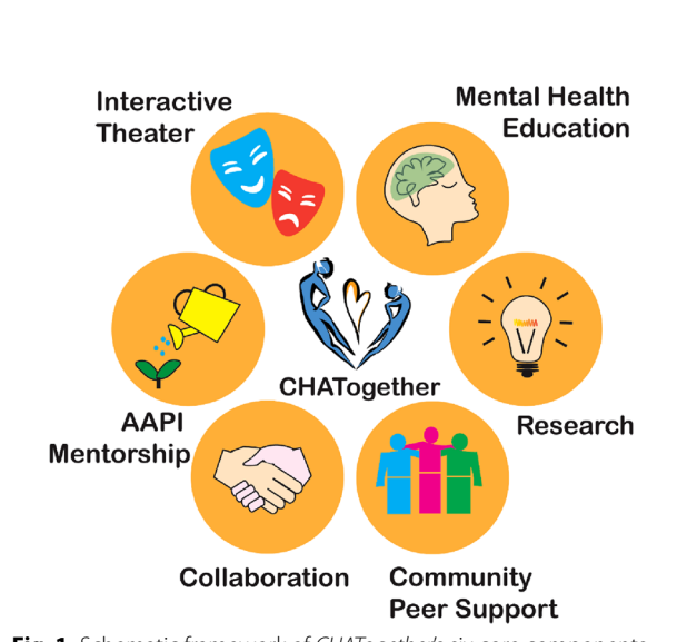
Fig. 1 Schematic framework of CHATogether 's six core components. Artwork by Dr. Chiun Yu Hsu

CHATogether harnesses the potential of storytelling and the arts, leveraging electronic platforms to address the dynamics of family life and to translate the stigmatized language of mental health into stories told through theater, visual arts, and other expressive outlets. CHATogether has six core components: (1) interactive theater; (2) mental health education; (3) research; (4) community peer support; (5) collaboration; and (6) AAPI mentorship (Fig. 1,2, 3 and Table 1). Each component